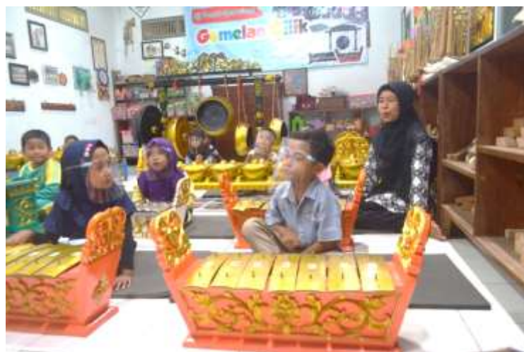
Figure 1. Parents provide assistance to children when playing little gamelan

The role of parents is very big influence on the success of students in learning. According to Lestari (2012) the role of parents is the methods used by parents regarding the tasks that must be carried out in raising children. Based on this understanding, it can the role of parents is the way parents are used in relation to their roles, which must be carried out in accordance with their duties because parents are the guide for the child. In this case, the behavior of parents who support children in learning activities based on local culture of little gamelan affects children in increasing motivation to learn little gamelan.